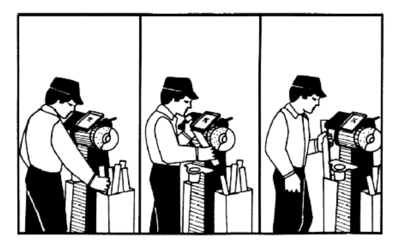
Figure 2. Grinding Castings: Hazards

Repeat the job observation as often as necessary until all hazards have been identified. Figure 2 shows basic job steps for grinding iron castings and any existing or potential hazards.