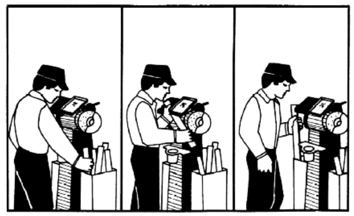
Figure 3. Grinding Castings: New Procedure or Protection

Figure 3 identifies the basic job steps for grinding iron castings and recommendations for new steps and protective measures.