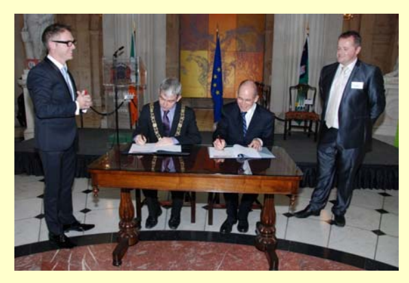
Intercultural City with Council of Europe