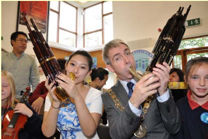
Ballymun Music Project Photocall—Beijing Visit