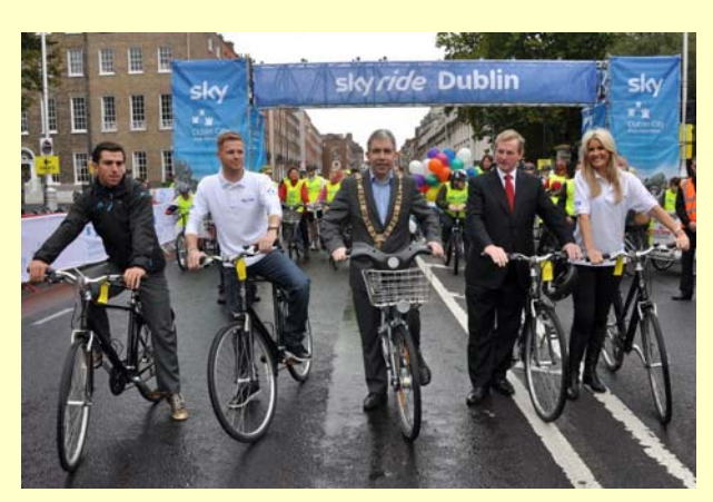
Skyride in September