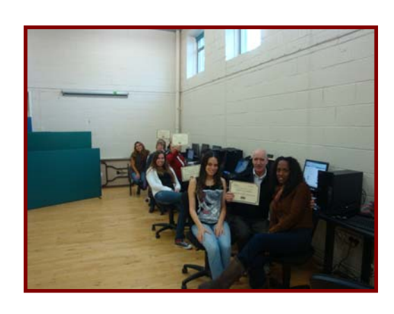
Students, tutors and certificates on last day of class in Fr Lar Redmond Centre in Drimnagh