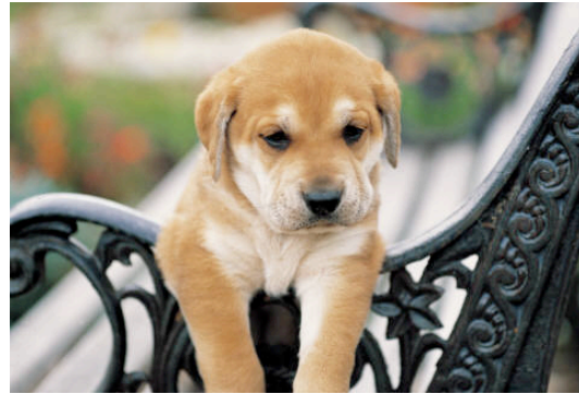
Caption describing photo or graphic.

great way to communicate with family and friends on a regular basis.