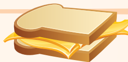
Gorilla Grilled Cheese Delight American cheese on Texas toast $5.99