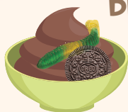
Lava Mud™ Creamy chocolate pudding with crushed Oreo® cookies and gummy worms $2.49