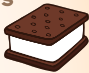
Tuki's Ice Cream Sandwich A classic vanilla flavored ice cream sandwich $1.49