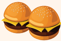
Rainforest Rascals™ Char-grilled mini burgers $5.99