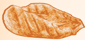
Grilled Chicken $6.99