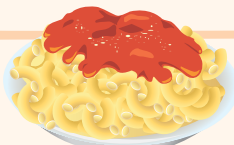
Python Pasta Served with your choice of Alfredo, Butter or Marinara sauce $5.99