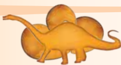
Jurassic Chicken Tidbits™ Dinosaur-shaped chicken nuggets $5.99 Substitute Chicken fingers $1.00 more