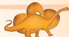
Shrimpkens™ Popcorn shrimp & Jurassic Chicken Tidbits™ $6.99