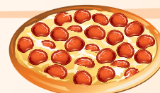
Castaway Kid's Pizza Cheese or Pepperoni $5.99