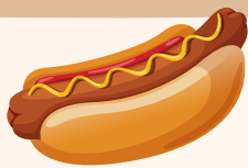
Hot Dog Traditional favorite $5.99