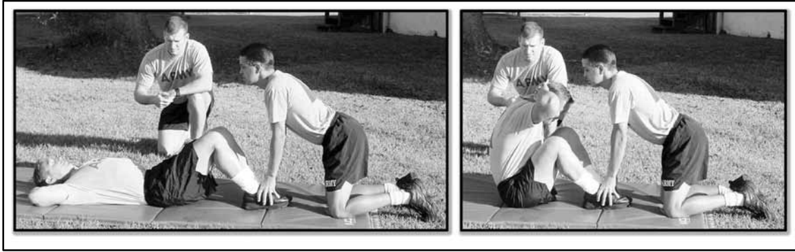
Figure A-4. Sit-up additional checkpoints

A-28. During the sit-up event, the scorer kneels or sits 3 feet from the Soldier’s left or right hip. The scorer’s head should be even with the Soldier’s shoulder when he is in the vertical (up) position (refer to Figure A-4). Additional checkpoints to explain and demonstrate for the sit-up event are as follows: