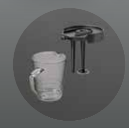
The Rivo® Frothing Pitcher is dishwasher safe.