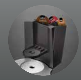
The Rivo® Pack Bin holds up to 12 used Rivo® packs.