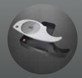
The removable Drip Tray catches any overflow.